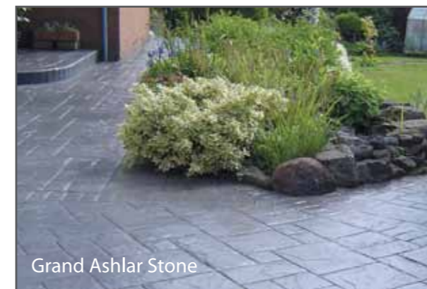
Grand Ashlar Stone