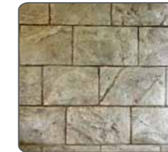
Large Cobble Paver