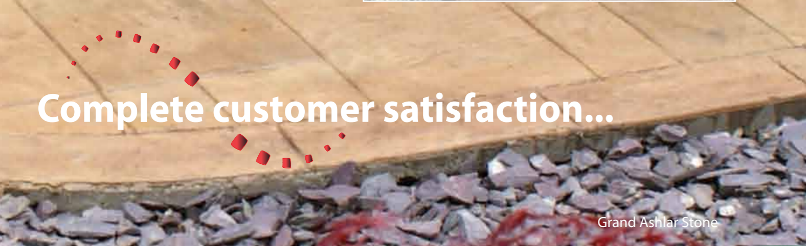
Grand Ashlar Stone