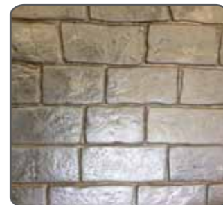
Old English Cobble