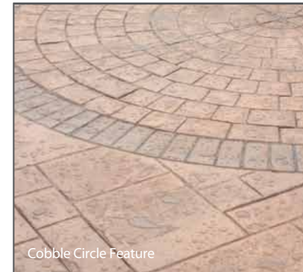
Cobble Circle Feature